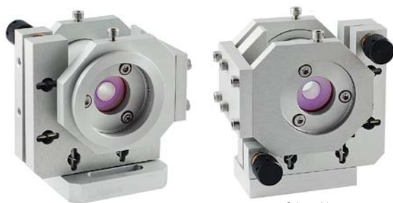
HPR series mounting stage for Pockels cell. KDP Pockels cell (available additionally) is mounted.

HPR series mounting stage for pockels cell is used for housing of Pockels cells in diameter of 35 mm.